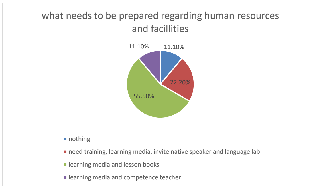
Picture 3. School needs regarding human resources and facilities

To answer the fourth question about what needs to be prepared regarding human resources and infrastructure, 11,1% said nothing, 22,2% said need training, learning media, invite native speaker and providing language lab, 55,5% need learning media and lesson books, and 11,1% said need both learning media and competence teacher.